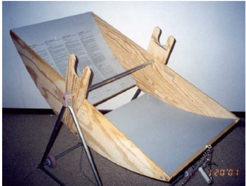
PHOTO: PARTIALLY BUILT SOLAR OVEN WITHOUT ABSORBER OR REFLECTIVE FILM