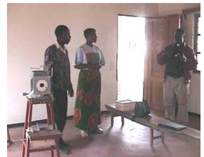
Grinder in Mlowa